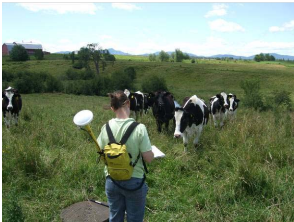
Figure 2. R.E.A. Technician Using GPS

R.E.A. was selected to complete a water mapping and geo-referenced database for a public water system in north-central Vermont. The project involved the compilation of data from over thirty years of Village sketches, drawings, notes and employee knowledge. All of the system components were field verified and located using GPS surveying techniques to sub-meter accuracy. In addition, R.E.A. assisted the town with initial set-up and training with the GIS software.