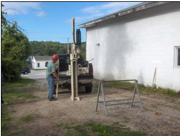
Figure 1. Installation of monitoring well during Phase II ESA.

R.E.A. completed a Phase I ESA for a commercial property in north-central Vermont, which identified several recognized environmental conditions (RECs) that warranted further investigation. During the subsurface investigation for the Phase II ESA, R.E.A. personnel discovered tetrachloroethene (PCE) contamination in groundwater beneath the site and in a sump located in the basement.