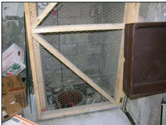
Figure 2. Basement sump contaminated with PCE

Subsequent investigations identified low concentrations of PCE in the basement indoor air and that the source of contamination was from a dry cleaning facility on the adjacent property. Based on the findings of the Phase II ESA, the VT DEC requested the owner of the dry cleaning facility to develop and implement a corrective action plan to address PCE contamination discovered in groundwater and indoor air.