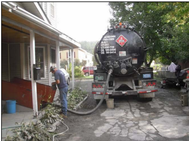
Figure 2. Vac-Truck removing fuel oil and contaminated water from basement

R.E.A. personnel quickly organized the mobilization of roll-off dumpsters, vac-trucks, ventilation fans and emergency generators to facilitate cleanup. At one location, R.E.A. coordinated the removal of over 2,000 gallons of fuel-oil contaminated water from the basement. The basement was then ventilated to allow safe access for work crews to finish the cleanup.