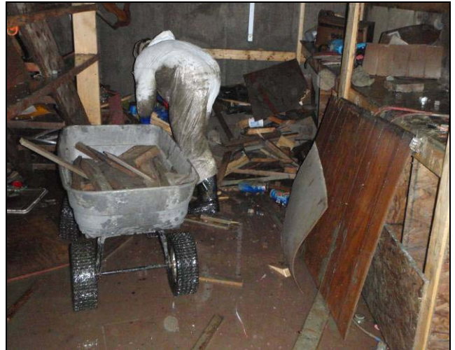
Figure 3. Removing contaminated debris and sediment from a basement

After the removal of fuel oil and contaminated water, R.E.A. personnel removed contaminated debris and sediment by hand and initiated the final cleanup. All waste material was then transported off site for proper disposal.